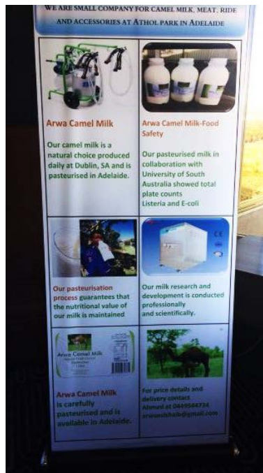
Poster on pasteurized camel milk production in Australia