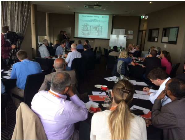
Forty persons participated to the forum on camel dairy Industry in Australia