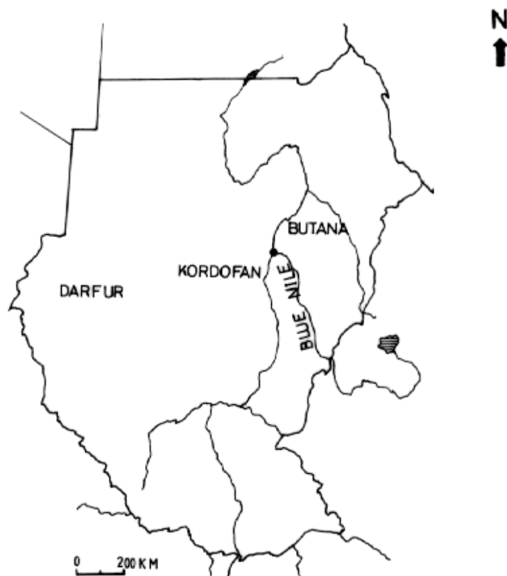
Fig. 1: Map of Sudan showing the study area

Research Project which aimed at the study of the husbandry and production parameters of camels in Butana area (Agab, 1993). In each visit to Butana area, an additional 15 to 20 herds which were not covered by the above mentioned project were also investigated. Frequent visits were made to the study area between July 1993 and December 1994. During the period of the study, the areas were visited eight times in response to reports of outbreaks of pox or pox-like diseases. Camel herds were investigated for the occurrence of camel pox, CCE and camel papillomatosis. Sick animals were carefully examined for clinical signs, number and location of skin lesions and also for the general body condition. Additional data concerning age and sex of animals affected or dead were collected. Herders' accounts of disease history and the progress of signs were also recorded.