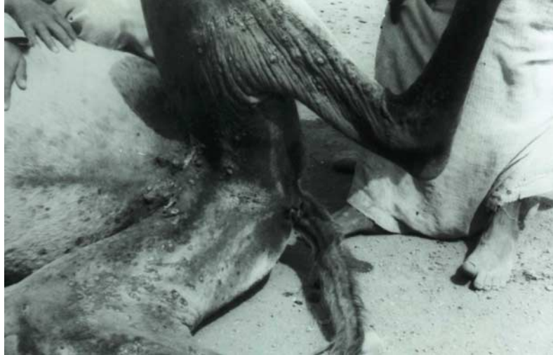
Fig. 2: Camel pox: A three year-old female camel showing pox eruptions on the groin and inner thighs.