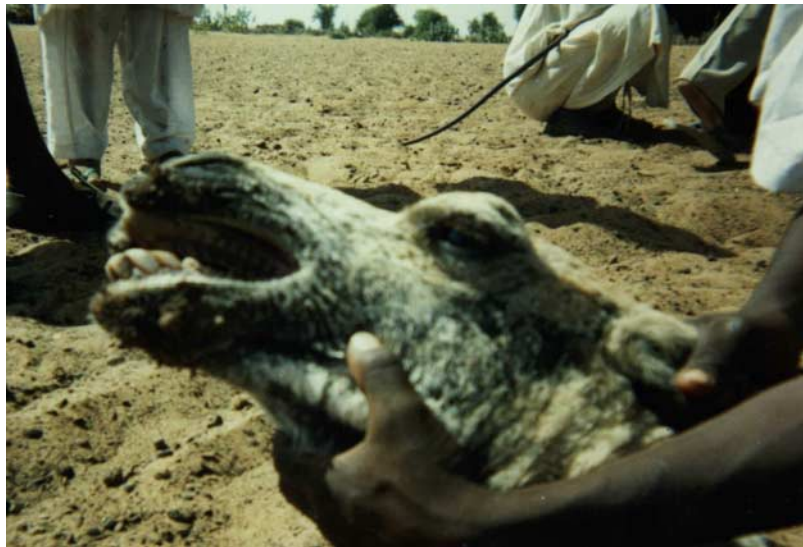
Fig. 6: Camel papillomatosis: Advanced stage of the wart growth on the upper and lower lips and the submandibular area.

The clinical picture of camel papillomatosis that observed in the present study was similar to that described by Dioli and Stimmelmayer (1992) in Kenya. The wart lesions appeared as round, cauliflower-like horny masses of 0.3-1.5 cm in diameter. The lesions first appeared as small flat elevations, rosy in color or hyperemic. Later, and within 1-2 weeks, they developed into round fissured or cauliflower-like horny masses taking the normal color of the skin (Fig. 6).