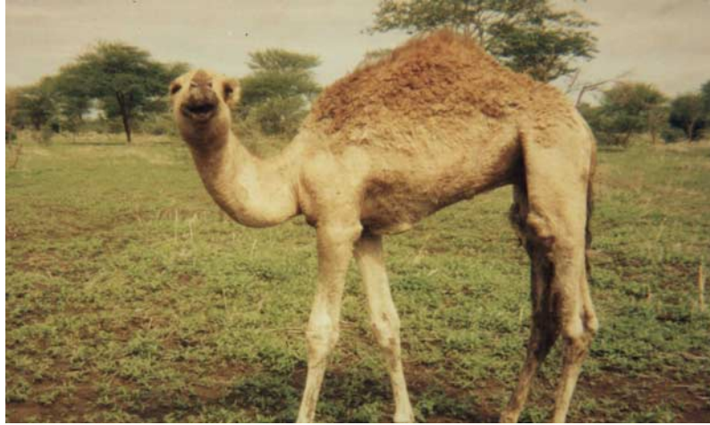
Fig. 4: Camel contagious ecthyma: Acutely affected young camel showing swelling of the head and upper part of the neck.